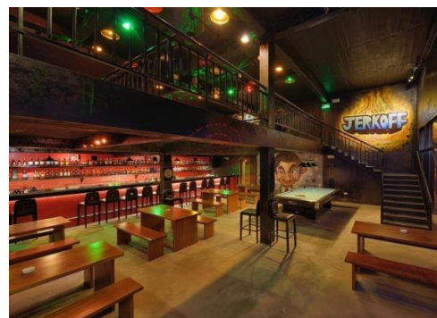
(PARADISE SUITES HOTEL, HALONG BAY)