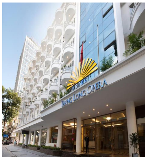
(Thang Long Opera Hotel)